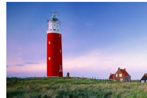
West Frisian Island